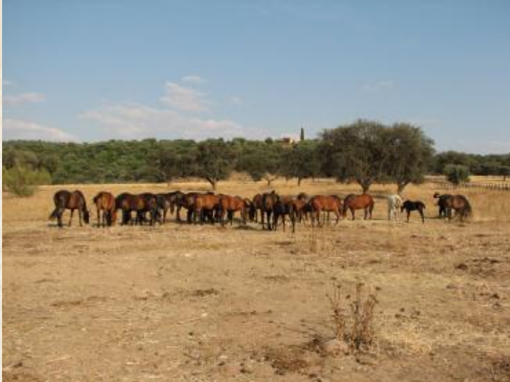
Breeding herd of PRE broodmares at Agropecuaria Madrigal, Spain, In July 2006